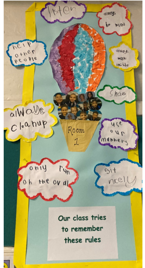
Room 1 poster created this week showing class expectations and values